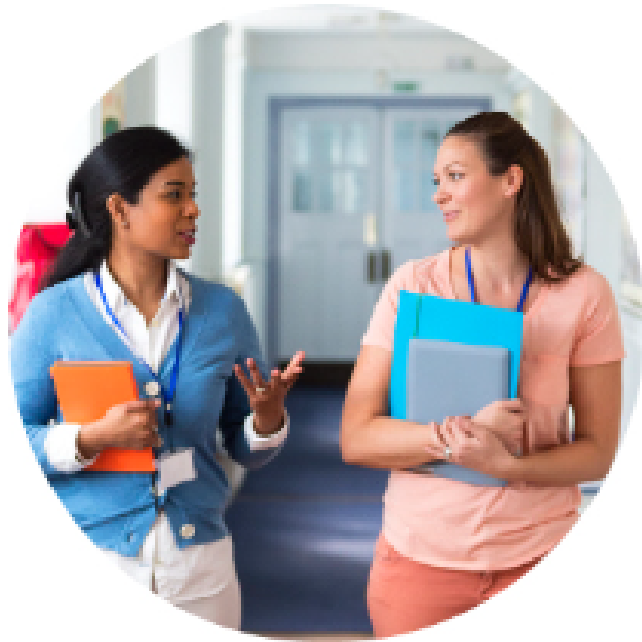
Accountability & Compliance